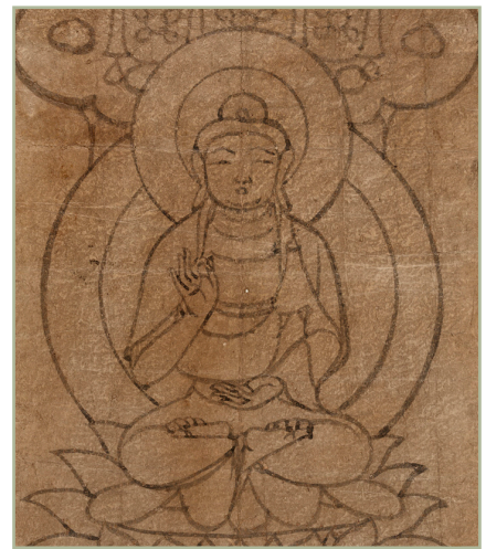
Top: Prints of Buddha. 1919,0101,0.254. Buddha with a Begging Bowl. 1919,0101,0.193. © The British Museum. Detail from a Paper Prayer Sheet. Or.8210/P.14. © The British Library Board. Bottom: Seated Bodhisattva. EO 1211a. Wooden Buddha. EO 1108. © Le musée Guimet. Buddha Stencil. IOL Tib J 1361. © The British Library Board.