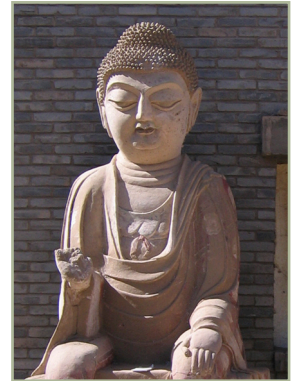
Replica figures at the Dunhuang Academy.

The Buddha has thirty-two lakṣaṇa or special physical characteristics which mark him out as a 'cosmic being'. The lakṣaṇa represent spiritual characteristics of the Buddha such as wisdom and enlightenment and also demonstrate the idea that Buddha's outer beauty is a reflection of his inner spiritual nature. In these images you may have noticed the tuft of hair or third eye between Buddha's eyebrows (ūrṇā) which symbolises spiritual insight or the bump on the top of the head (uṣṇiṣa) which symbolises wisdom and spirituality and his attainment of enlightenment.